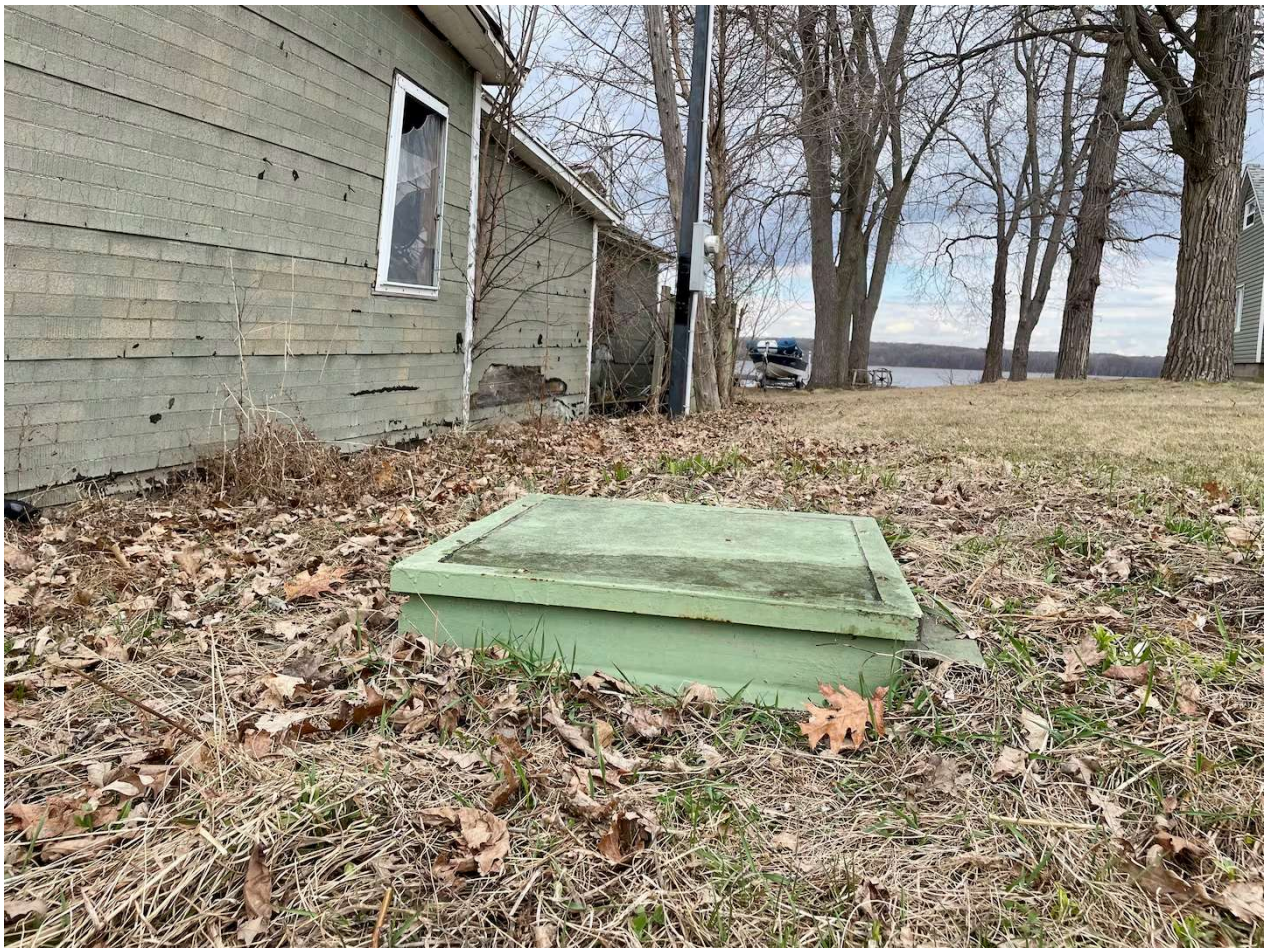
One of the private wells in Rigaud, Que. that the town has had to take over due to the sudden closure of Aqua-Gestion.